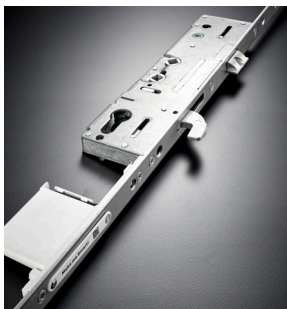
SensCheck smart security