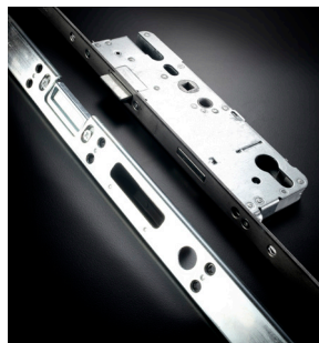
Multipoint locks and keeps