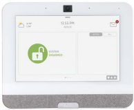
IQ Panel 4 Security panel