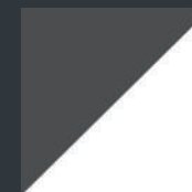
Grey Out/ White In