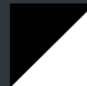
Black Out/ White In