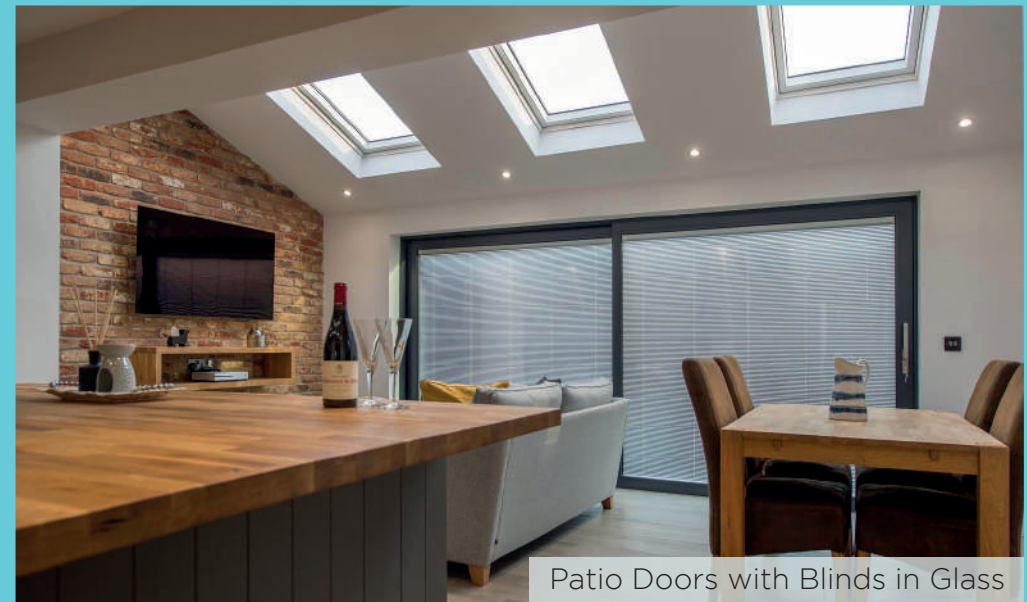
Patio Doors with Blinds in Glass