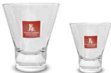
Large Y-glass / Small Y-glass