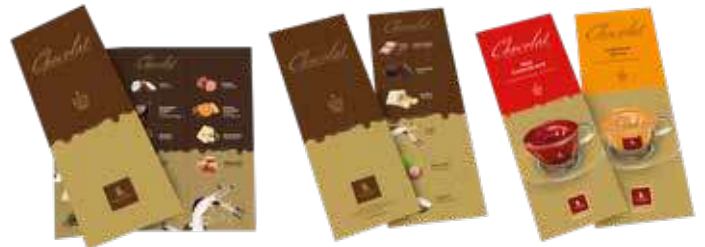
Folding 3-door / 2-door / 1 door