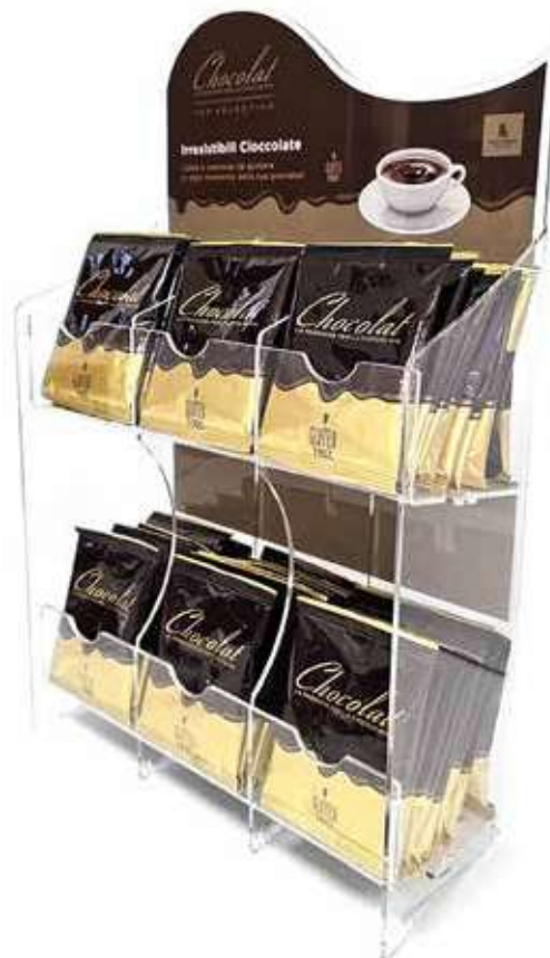
Plexiglass display stand