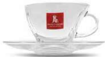
Cup with saucer for hot drinks