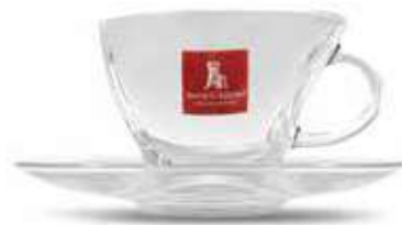
Large cup with saucer for hot drink