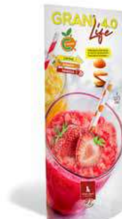
Two-sided totem 80x150