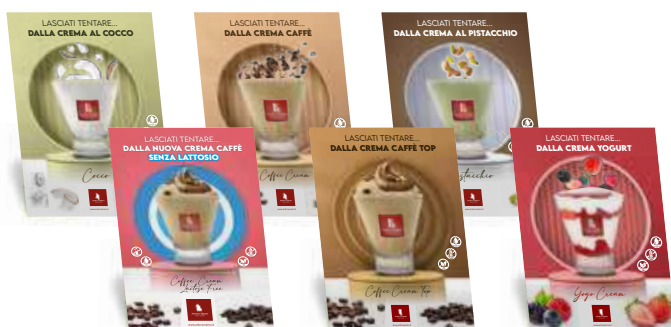
Countertop sign 20x30