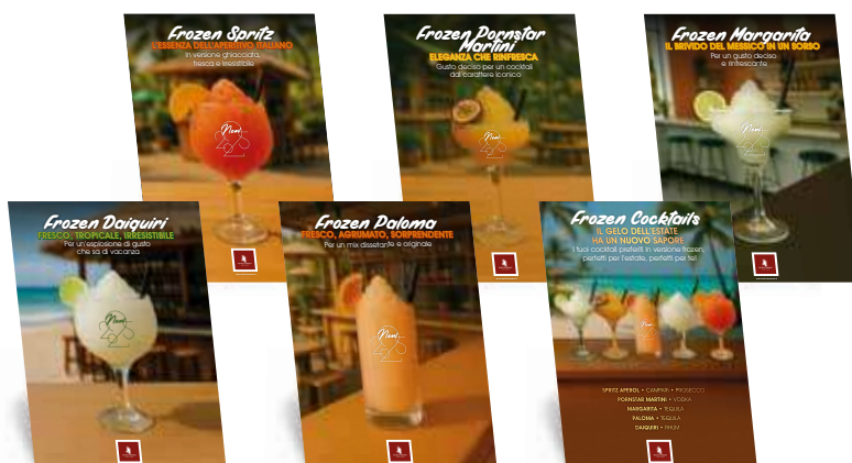
Countertop sign 20x30