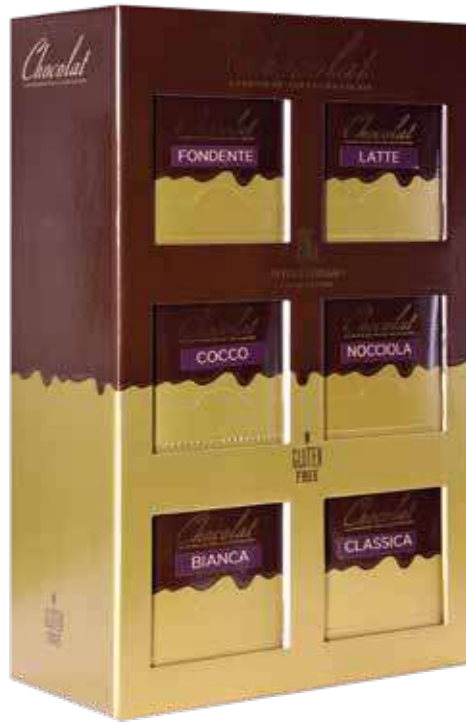
6-flavour display kit