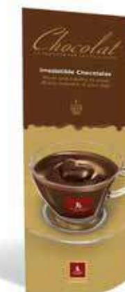
Double-sided totem 80x150