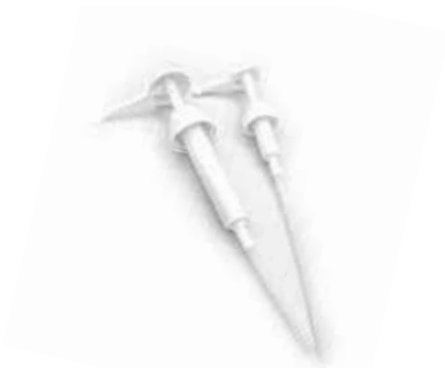
Flavour enhancer / syrup dosing pump