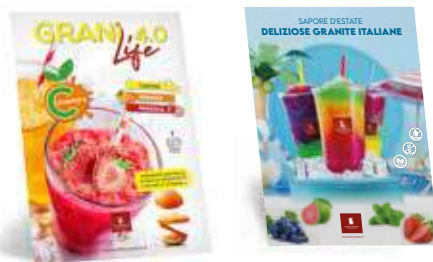
Countertop sign 20x30