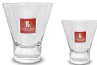
Large Y-glass / Small Y-glass