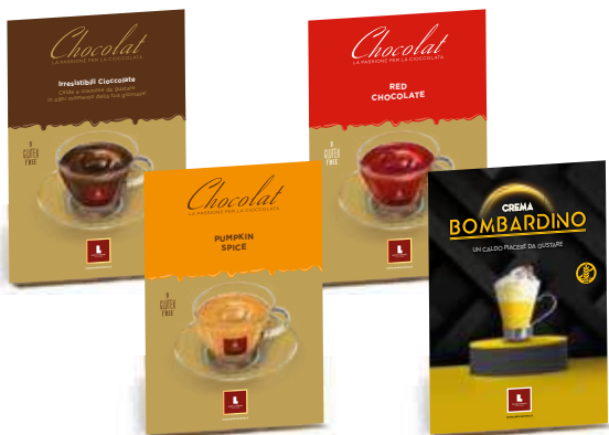
Countertop sign 20x30