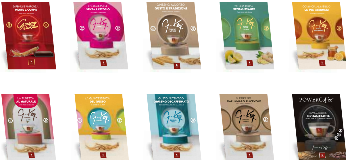
Countertop sign 20x30