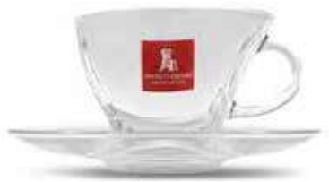
Large cup with saucer for hot drinks