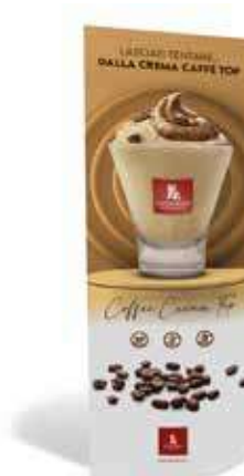
Two-sided totem 80x150