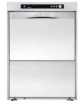
ELECTRON Series Premium Double Skin