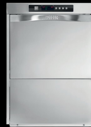
Under Counter Dishwashers