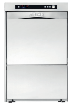
DS T Series Double Skin