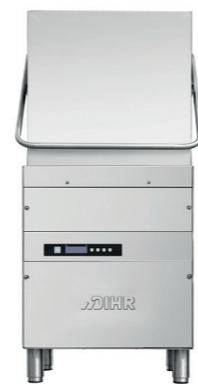
HT 12 ELECTRON Series Premium Double Skin

The DIHR LP range LP utensil washer line have a control panel with easy and intuitive functions. LP Range features undercounter and hood-type models and does the job for you in full comfort, thanks to its ultra-low-sound level and minimal heat loss in the room.