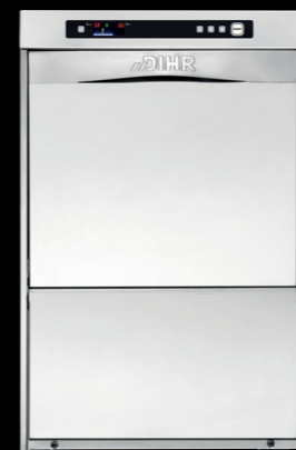
Under Counter Glasswashers

The DIHR product range includes, glasswashers, undercounter, hood-type, utensil, rack and flight dishwashers. These products are designed with a strong emphasis on providing customised washing solutions. DIHR's vision is to minimize the use of environmental resources and reduce customer operating costs.