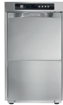
ELECTRON Series Premium Double Skin

Delivering uncompromising results, the undercounter dishwasher range covers all customers requirements. From the robust, everyday dishwashers, to the double skinned dishwashers with energy saving features designed to be silent and reliable.