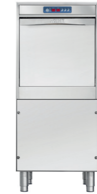
LP1 S5 Plus Double Skin Front Loading