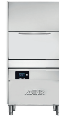
LP1 S8 PLUS, LP2 S PLUS, LP3 S PLUS, LP4 S8 PLUS Double Skin

The DIHR LP range LP utensil washer line have a control panel with easy and intuitive functions. LP Range features undercounter and hood-type models and does the job for you in full comfort, thanks to its ultra-low-sound level and minimal heat loss in the room.