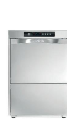
LP1 S4 Series Double Skin Under Counter