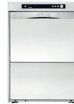
DS T Series Double Skin