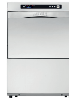
GS T Series Single Skin

Delivering uncompromising results, the undercounter dishwasher range covers all customers requirements. From the robust, everyday dishwashers, to the double skinned dishwashers with energy saving features designed to be silent and reliable.