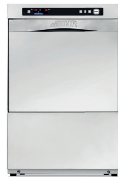
GS T Series Single Skin

More and more business owners are realising the benefits of having a separate dishwasher that is only used for washing glasses. A glasswasher reduces both the amount of broken glasses and the need to manually polish the glasses. An essential appliance for busy bars and restaurants where hand washing is not an efficient solution, with fast wash cycles helping to provide a constant stream of clean glasses.