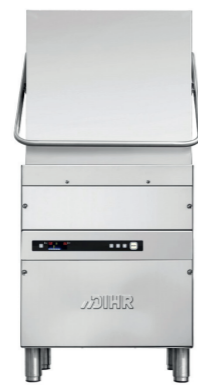
HT 11 I Series Double Skin