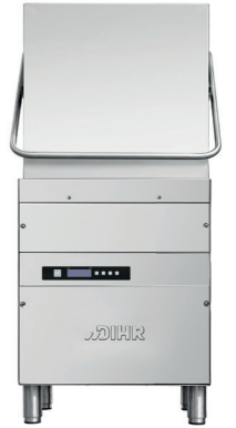
LP1 400 Plus Single Skin Hood-Type