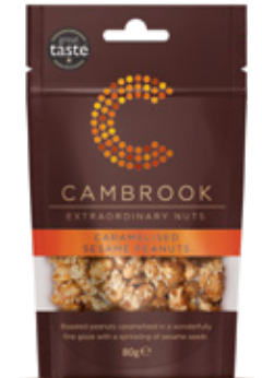
Caramelised Sesame Peanuts