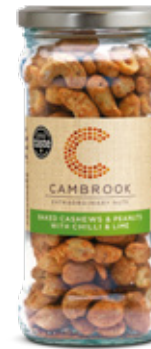
Baked Cashews & Peanuts with Chilli & Lime