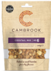
Cocktail Mix No 6