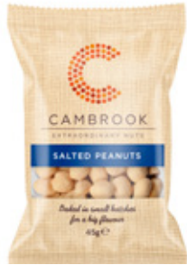
Baked & Salted Peanuts