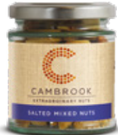
Baked & Salted Premium Mixed Nuts