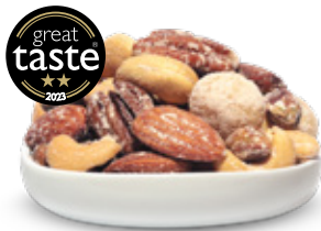
Mix 18: Truffle & Pecorino Nut Mix