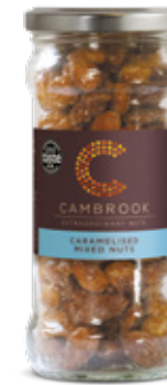
Caramelised Mixed Nuts