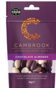
Chocolate Almonds (90g)