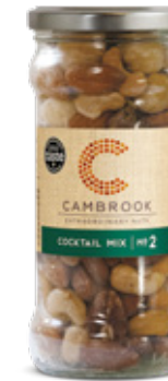
Cocktail Mix No 2