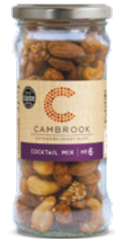
Cocktail Mix No 6