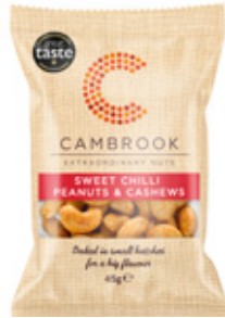
Sweet Chilli Peanuts & Cashews