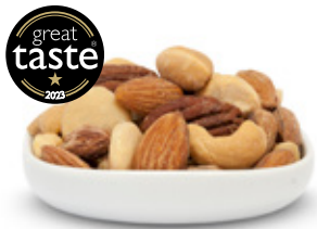
Mix 2: Baked & Salted Nut Mix