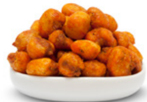
Giant Chilli Corn