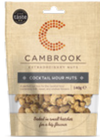
Cocktail Hour Nuts