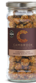
Caramelised Sesame Hazelnuts