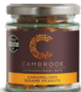
Caramelised Sesame Peanuts