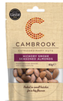
Hickory Smoke Seasoned Almonds