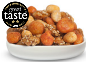
Mix 23: Spicy & Sweet Snack Mix