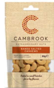
Baked & Salted Cashews