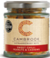
Sweet Chilli Peanuts & Cashews