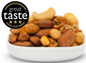
Mix 6: Salted, Smoked, Caramelised & Spiced Nut Mix