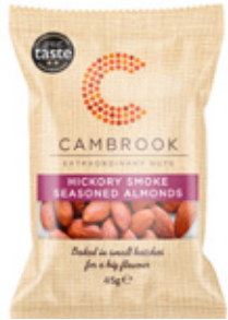
Hickory Smoke Seasoned Almonds