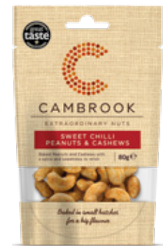
Sweet Chilli Peanuts & Cashews