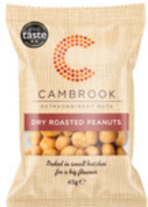
Dry Roasted Peanuts