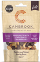
Mixed Nuts with Chocolate Cranberries