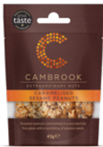
Caramelised Sesame Peanuts