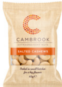
Baked & Salted Cashews