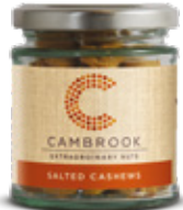
Baked & Salted Cashews