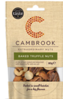
Baked Truffle Nuts