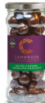
Salted Caramel Chocolate Hazelnuts