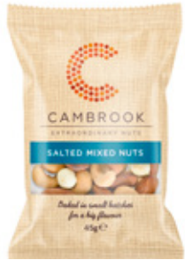
Baked & Salted Mixed Nuts