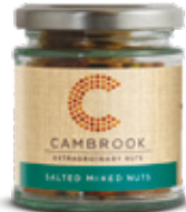
Baked & Salted Classic Mixed Nuts