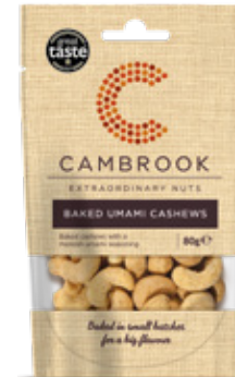
Baked Umami Cashews