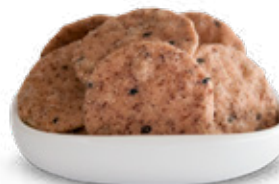
Black Pepper Crackers