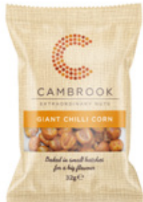
Giant Chilli Corn (32g)