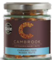
Caramelised Mixed Nuts