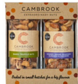
2 Jar Gift Box