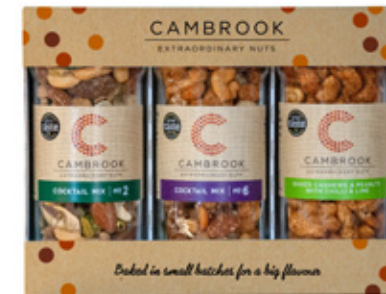
3 Jar Gift Box