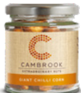
Giant Chilli Corn