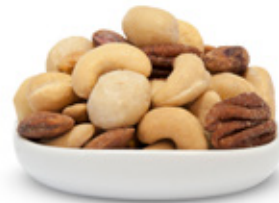
Mix 15: Baked Truffle Nuts