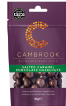
Salted Caramel Chocolate Hazelnuts (90g)