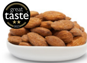
Hickory Smoke Seasoned Almonds