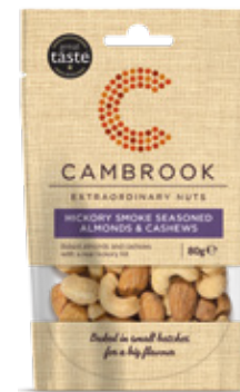
Hickory Smoke Seasoned Almonds & Cashews