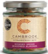
Hickory Smoke Seasoned Almonds