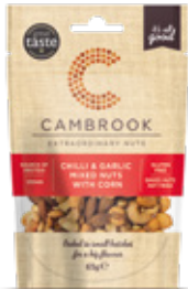
Chilli & Garlic Mixed Nuts with Corn