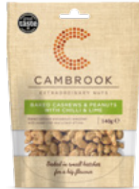
Baked Cashews & Peanuts with Chilli & Lime