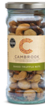
Baked Truffle Nuts