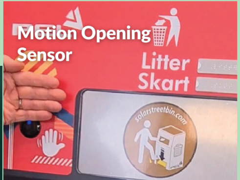
Motion Opening Sensor