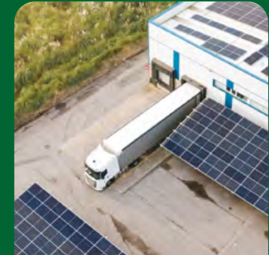
Transport and logistics

Our experience also enables us to work across a wide variety of public and private sector organisations, including schools, sports venues and large-scale infrastructure projects.