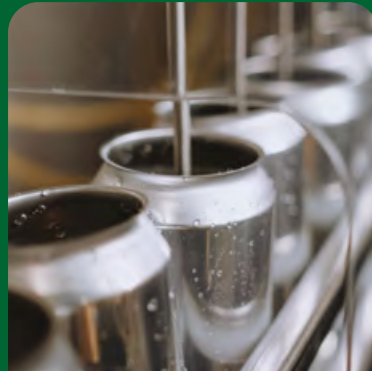
Food and drink processing