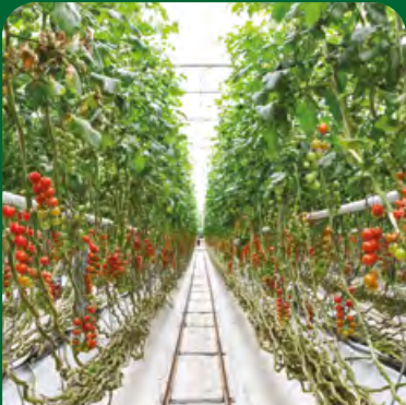
Agriculture and horticulture

While our heritage is rooted in agriculture, our expertise extends far beyond it.