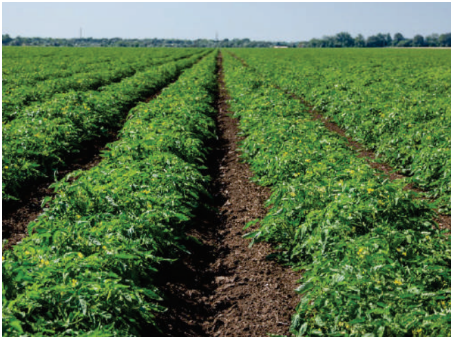
Tomatoes in the field

We grow our tomatoes with eco-friendly tools and technologies. Handling an accurate soil building practices we save the fertility and retain natural resources. All our agro-activities are assured by GlobalG.A.P. worldwide standard.