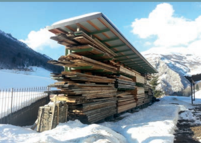
Cantilever racking with roof at a carpentry company optimal outdoor storage