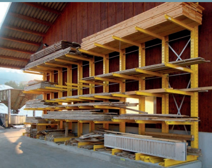
Longspan shelving below the awning of a carpentry company. Different varieties and dimensions stored safely and organized with cantilever racking