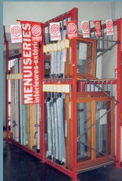
Storage of windows and doors using Pallet racks Perfect customer presentation in the showroom