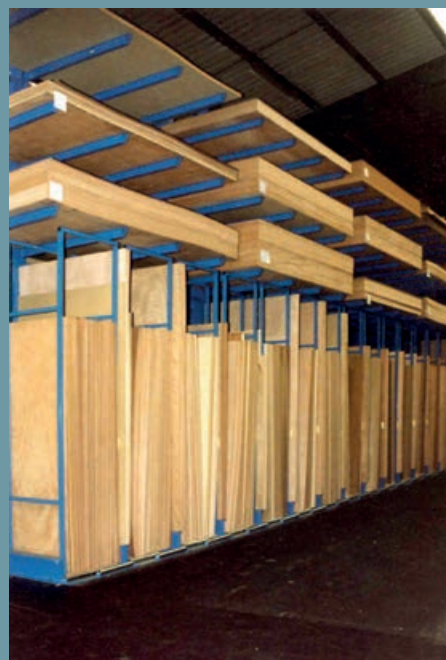
Combination of cantilever racking with integrated chipboard racking. High storage density on minimal surface area

Examples of applications in your industry