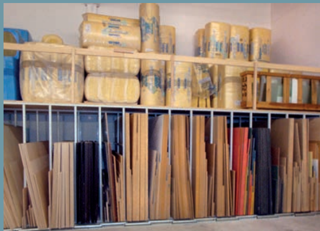
Standing storage for chipboards with use of the top side as an additional storage level