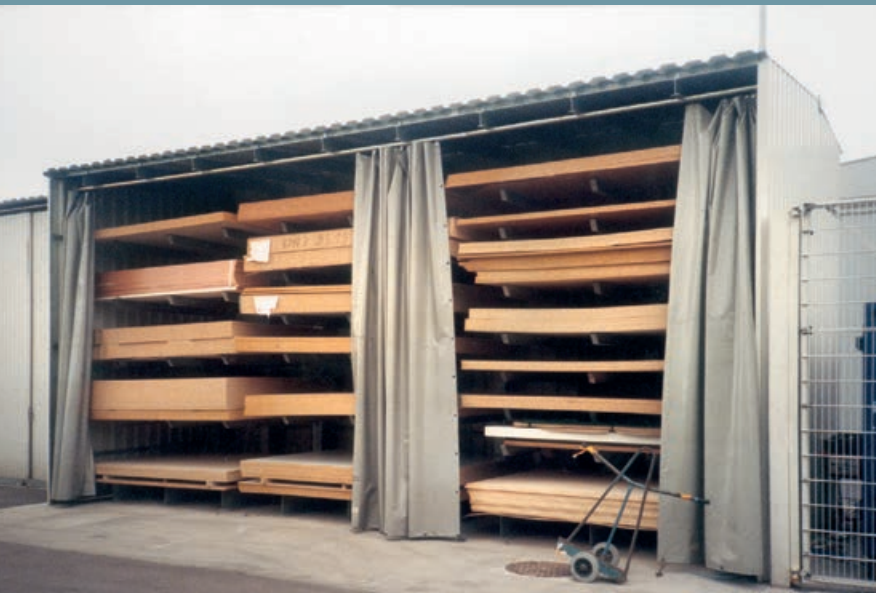
Individual storage solution for wood pallets Cantilever racking with roof and wall plus drapery installed by the customer to protect against rain and snow