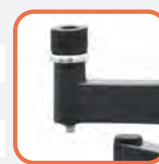
RUBBER PROTECTION CAPS