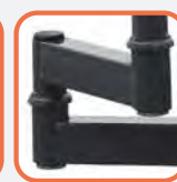
PROTECTION AGAINST STAINS ON HINGED PARTS

Haven't found the right solution yet? Contact us for the possibilities. We will gladly advise you about the appropriate solution.