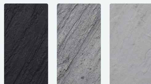
Riven Stone Black 094 Riven Stone Grey 098 Riven Stone White 099