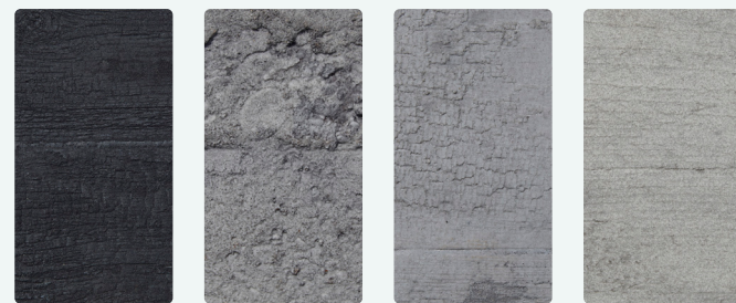
Fire Plank Black 093 Deep Texture 120 Fire Plank Grey 092 Rustic Grey 007