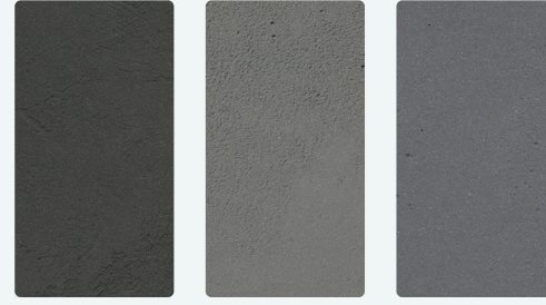
Charcoal Cement 043 Cool Cement 008 French Cement 005