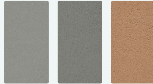
Taupe Cement 010 Lime Cement 035 Sand Cement 004