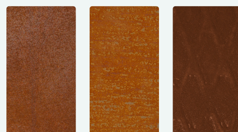
Rust Smooth 021 Rust Textured 022 Rust Waffle 002