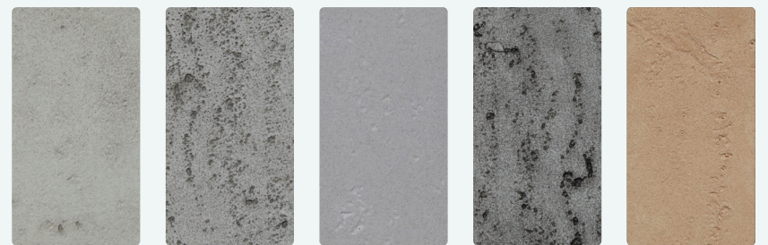
Travertine Light Grey 005 Travertine Dark Grey 084 Travertine White 082 Travertine Black 085 Travertine Sand 086