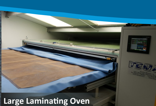
Large Laminating Oven