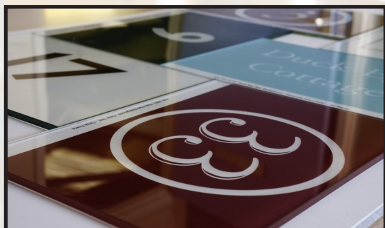
House numbers printed on glass in colour, etched effect or black and white