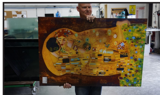
Any image, pattern or vector design printed on glass. UV Proof and Weather/Scratch Resistant