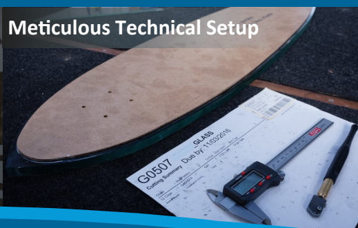
Meticulous Technical Setup