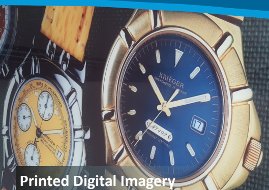
Printed Digital Imagery