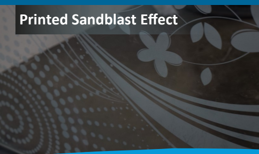
Printed Sandblast Effect