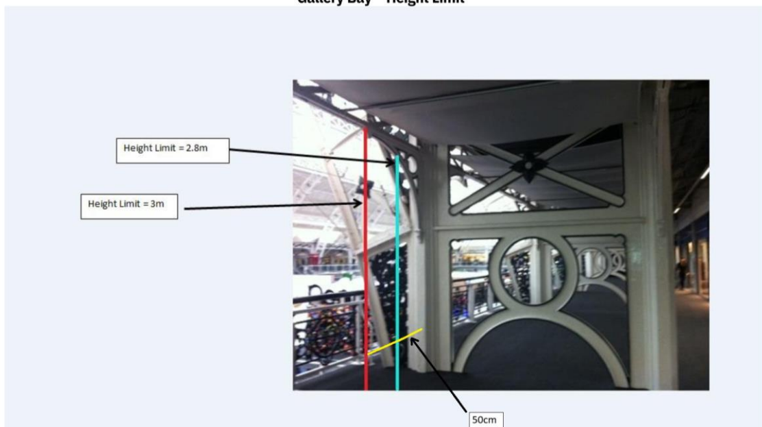
Gallery Bay – Height Limit

Due to the venue structure, the Gallery Bays have ironwork which you must consider when designing your stand. This ironwork is likely to affect your build as to whether you incorporate cut-outs into your walling to fit around the ironwork, or you can bring your walling forward by 50cm to avoid the ironwork.