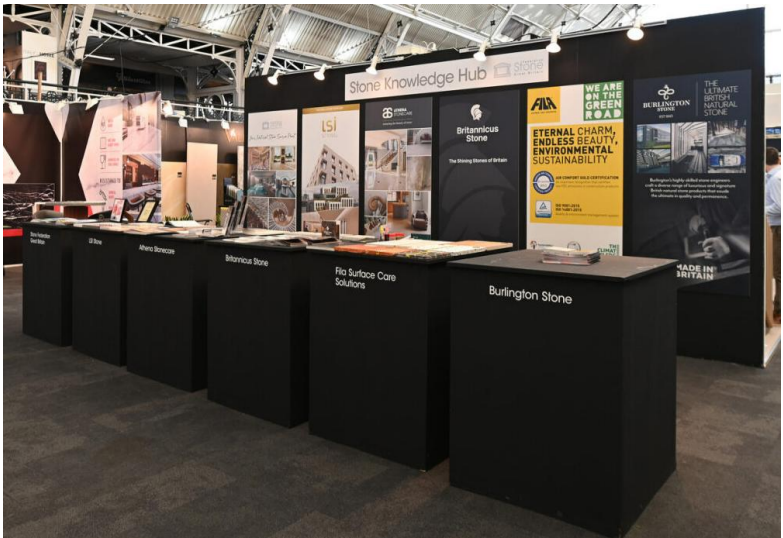
This is a reference photo from a past event.

*Please note this is for visual purposes, the area may differ slightly*