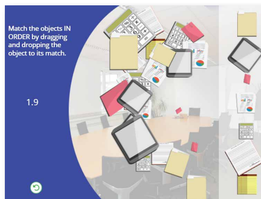
*Actual interactive exercise

In eLearning, you control the pace of action. eLearning brings the knowledge directly to you, no matter where you are or when you need it. You have complete freedom to explore and revisit lessons.