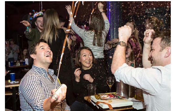
Competitions and prize giveaways