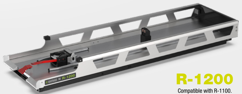
R-1200 Compatible with R-1100.

Its manual release and 10G certification ensure confidence and safety in any situation, establishing SILVER+ as the superior choice in healthcare and efficient patient transport.