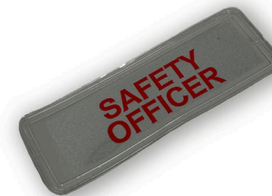
-S-LAB SMALL CUSTOMISABLE REFLECTIVE ROLE LABEL 138MM X 47MM