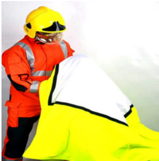
-S-SEP016 CASUALTY SHEET