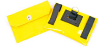
-S-FBAPLP1 PVC PERSONAL LINE POUCH