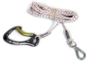
-S-FBAPL1 POLYESTER PERSONAL LINE