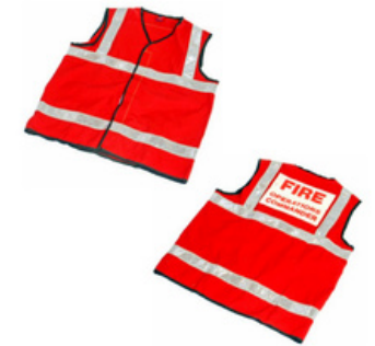
-S-SUR200 CLASS 2 OPERATIONS COMMANDER SURCOAT