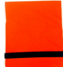
-S-SEP002 C POST COVER