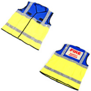
-S-SUR199 CLASS 2 SAFETY OFFICER SURCOAT