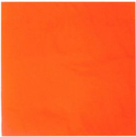
-S-SEP003 SMALL BLANKET