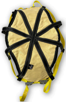
-S-SEP012 MK3 HGV AIRBAG PROTECTOR