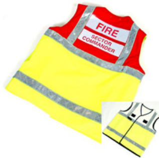
-S-SUR186 CLASS 2 REVERSIBLE IC-SC SURCOAT