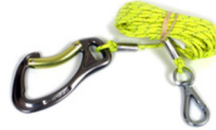
-S-FBAPL2 ARAMID PERSONAL LINE