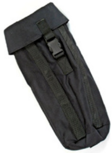
-S-FBAGLB2 NOMEX 60M GUIDE LINE BAG