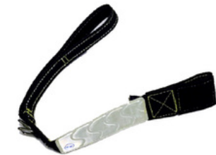
-S-AES001 ANTI-ENTRAPMENT STRAP