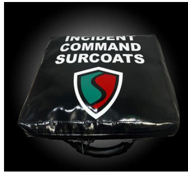
-S-GBB001 GLOW BOLERO BAG SURCOAT