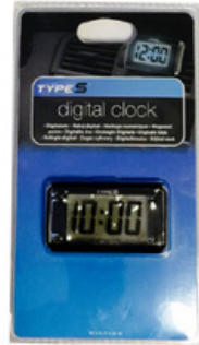
-S-INCO03 DIGITAL CLOCK