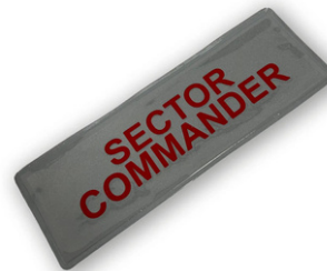
-S-LAB LARGE CUSTOMISABLE REFLECTIVE ROLE LABEL 300MM X 100MM