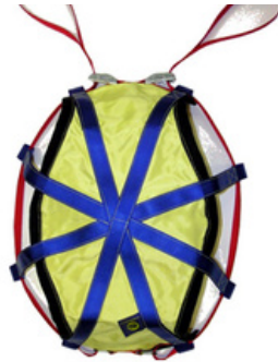
-S-SEP011 MK3 AIRBAG PROTECTOR