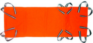
-S-SEP007 WINDSCREEN BLANKET