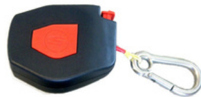
-S-FBAPL3 RETRACTABLE LINE - STAINLESS STEEL