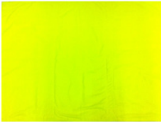
-S-SEP005 LARGE BLANKET