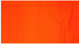
-S-SEP006 EXTRA LARGE BLANKET