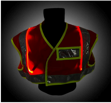
-S-GBS006 GLOW BOLERO TACTICAL ADVISOR SURCOAT