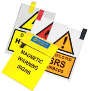
-S-MAGX10 MAGNETIC WARNING SIGN SET (SET OF 4)