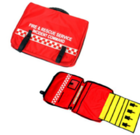
-S-INCO02 A3 INCIDENT COMMAND WALLET