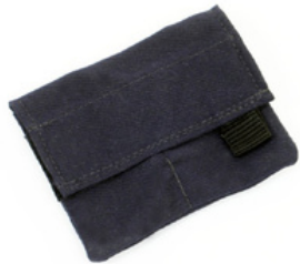
-S-FBAPLP3 SMALL NOMEX PERSONAL LINE POUCH