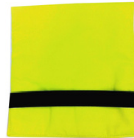
-S-SEP001 AB POST COVER