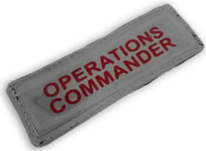
-S-LAB SMALL CUSTOMISABLE REFLECTIVE ROLE LABEL WITH HOOK FASTENER 138MM X 47MM