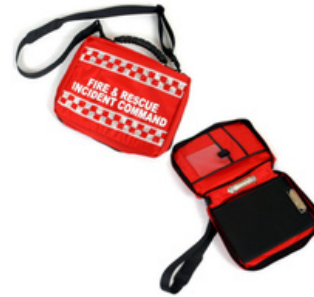
-S-INCO01 A4 INCIDENT COMMAND WALLET