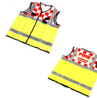
-S-SUR201 CLASS 2 COMMAND SUPPORT SURCOAT