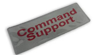
-S-LAB LARGE CUSTOMISABLE REFLECTIVE ROLE LABEL WITH HOOK FASTENER 300MM X 100MM