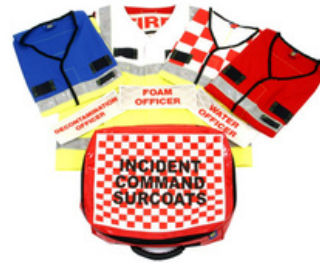
-S-IGIS INCIDENT COMMAND SURCOAT SET