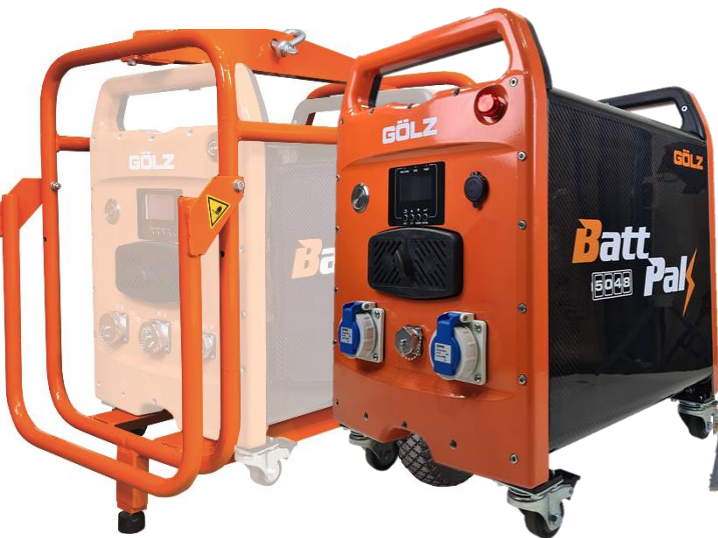
Protective transport Trolley