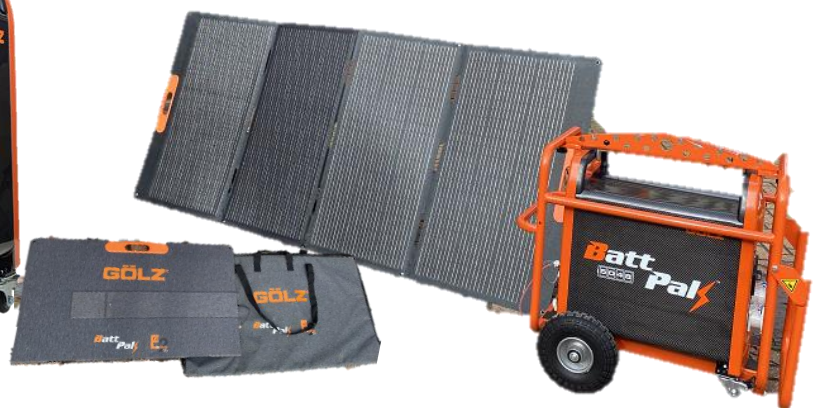
Foldable Solar Panel 400W and carry case