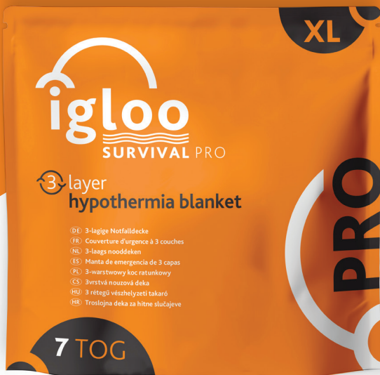
IG004 IGLOO PRO 3-LAYER HYPOTHERMIA BLANKET X LARGE | Emergency Orange 2.3m x 2m | 7 TOG