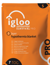
IG015 IGLOO PRO HYPOTHERMIA BLANKET BABY | Emergency Orange 1.1m x 1.5m | 7 TOG