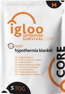
IG010 IGLOO CORE 2-LAYER HYPOTHERMIA BLANKET MEDIUM | Emergency Orange 2.3m x 1.5m | 5 TOG

A 2-layer blanket: Designed to maintain body heat.