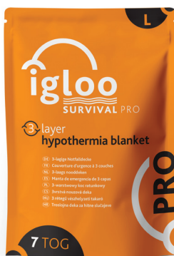
IG002 IGLOO PRO 3-LAYER HYPOTHERMIA BLANKET LARGE | Emergency Orange 2.3m x 1.8m | 7 TOG