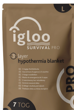
IG001 IGLOO PRO 3-LAYER HYPOTHERMIA BLANKET LARGE | Coyote Brown 2.3m x 1.8m | 7 TOG