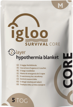
IG009 IGLOO CORE 2-LAYER HYPOTHERMIA BLANKET MEDIUM | Coyote Brown 2.3m x 1.5m | 5 TOG