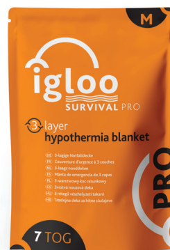
IG008 IGLOO PRO 3-LAYER HYPOTHERMIA BLANKET MEDIUM | Emergency Orange 2.3m x 1.5m | 7 TOG