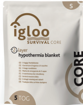
IG011 IGLOO CORE 2-LAYER HYPOTHERMIA BLANKET SMALL | Coyote Brown 1.1m x 1.5m | 5 TOG