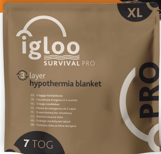
IG003 IGLOO PRO 3-LAYER HYPOTHERMIA BLANKET X LARGE | Coyote Brown 2.3m x 2m | 7 TOG