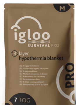
IG007 IGLOO PRO 3-LAYER HYPOTHERMIA BLANKET MEDIUM | Coyote Brown 2.3m x 1.5m | 7 TOG