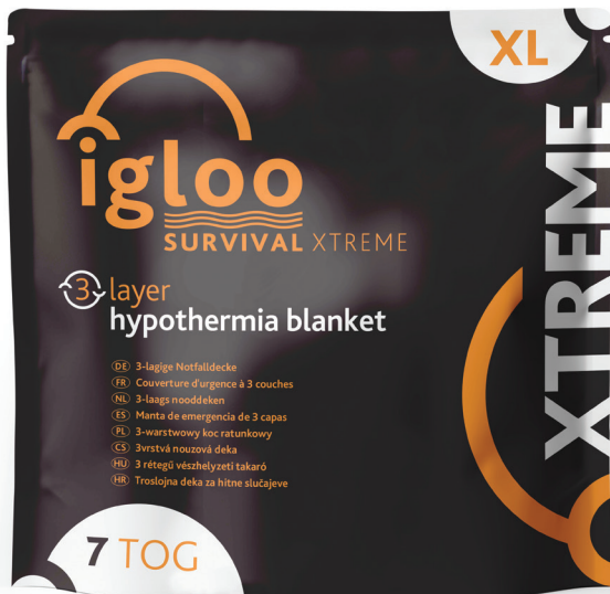
IG006 IGLOO XTREME 3-LAYER HYPOTHERMIA BLANKET + HEAT X LARGE | Emergency Orange 2.3m x 2m | 7 TOG

A 3-layer blanket with heat pads: Designed to maintain body heat in scenarios involving critical, life threatening, injuries and conditions.