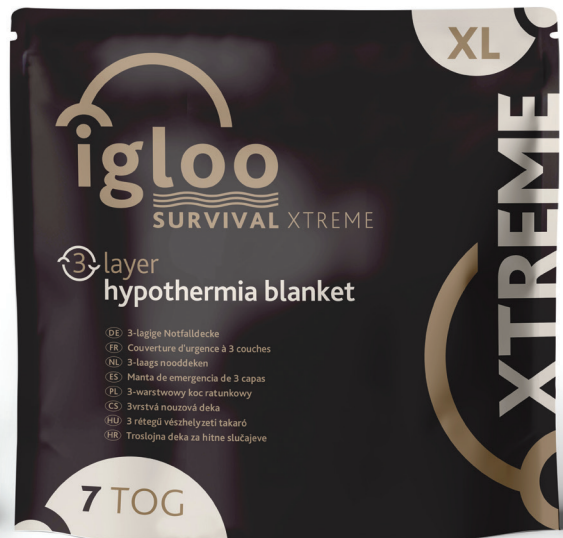
IG005 IGLOO XTREME 3-LAYER HYPOTHERMIA BLANKET + HEAT X LARGE | Coyote Brown 2.3m x 2m | 7 TOG