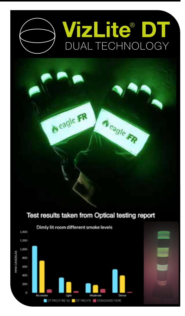
Certified according to

Revolutionary knuckle design enhances dexterity, comfort, and fit, ensuring seamless manoeuvrability and control. Ceramic coating boosts abrasion resistance for unparalleled durability. Aramid knitted lining and suede cowhide leather palm provides exceptional durability, thermal protection and grip.