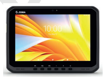
Zebra ET60/65 10.1" Android 12-16 Enterprise Tablet, Oualcomm® 6490 octa-core, WiFi 6E & optional 5G, IP66, Extended battery provides 20Hrs battery life