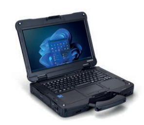
Panasonic Toughbook 40

14" Windows 11 Pro, Fully Rugged Notebook, IP66, up to 36Hrs with 2nd battery