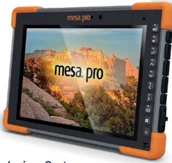
Juniper Systems Mesa Pro (10")