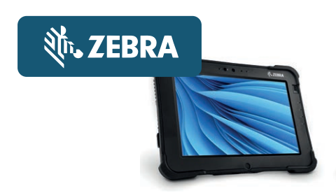
Zebra L10ax (10.1")