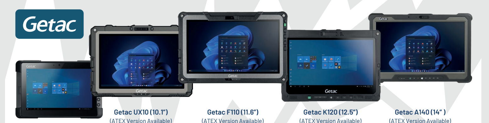
Getac T800 (8") (ATEX Version Available)