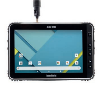
Handheld Algiz RT10 10" Android 11 GMS Tablet, optional RTK GPS, IP67