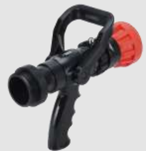
Attack 750-Pro Series Nozzle