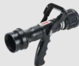
H500 Mid-Range Nozzle