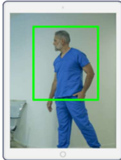
1 Presence Detection

Blue Mirror is here to improve life through Artificial Intelligence (AI). We use AI to power products that can improve and save lives. Blue Mirror keeps healthcare workers and patients safer by providing a virtual PPE Instructor.