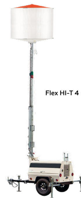
Flex HI-T 4 000 W