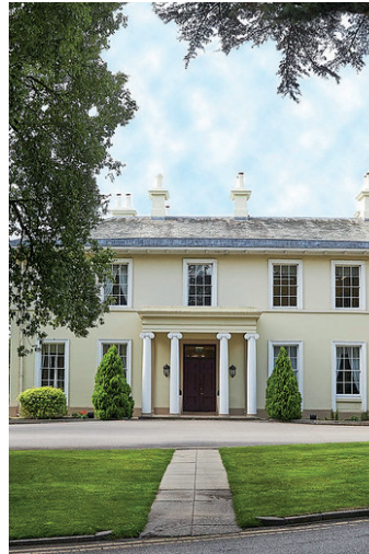
EASTWOOD HALL Mansfield Road, Eastwood, Nottingham, NG16 3SS

+44 (0) 1793 819 000 swindonalexandrahouse.co.uk