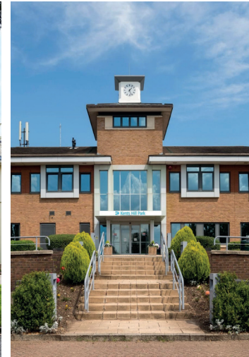
KENTS HILL PARK Swallow House, Timbold Drive, Milton Keynes, MK7 6BZ

+44 (0) 1773 532 532 eastwood-hall.co.uk