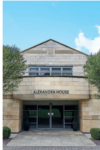
ALEXANDRA HOUSE Whittingham Drive, Swindon, SN4 0QJ

Bedrooms: 152 Max event capacity: 240 Meetings rooms: 16 240 Theatre | 130 Cabaret 200 Banquet