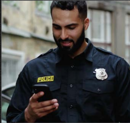
Officers can upload evidence from a WiFi device through the vehicle's LTE connection.