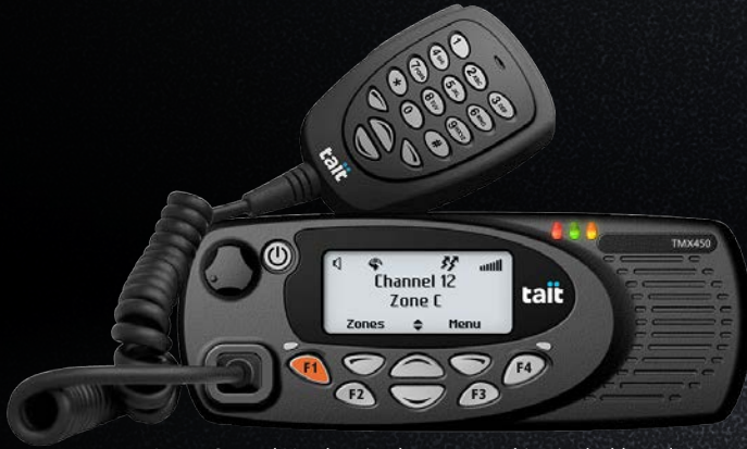
Large Control Head option keeps everything in dashboard view and allows radio body installation anywhere in the vehicle.