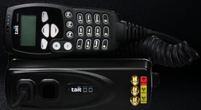
Handheld Control Head option puts all functions in the palm of your hand and allows radio body installation anywhere in the vehicle.