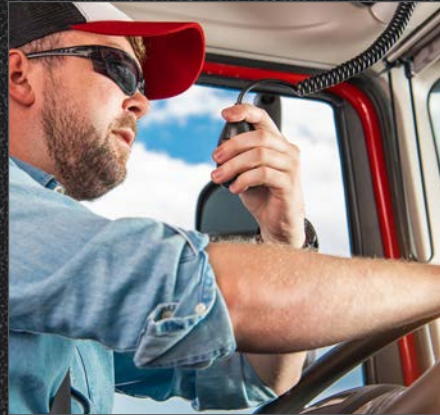
Transport drivers can use broadband to stay in touch with dispatch through radio dead zones.