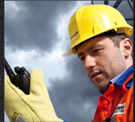
Utility workers can automatically be alerted to advancing lightning storms.