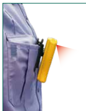
Body-worn video camera angled downwards without Anti-Tilt Attachment fitted to the Crocodile Garment Clip

When there are no issues with a garment, the Anti-Tilt Attachment can be easily removed.