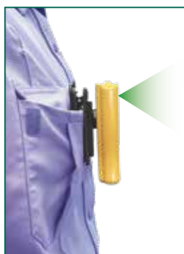
Body-worn video camera angled straight ahead with Anti-Tilt Attachment fitted to the rear of the Crocodile Garment Clip and inserted in a shirt pocket