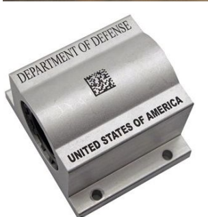
Laser Etched 2D Barcode