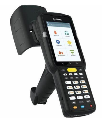
MC3390R Long-Range UHF RFID Reader Barcode Scanners