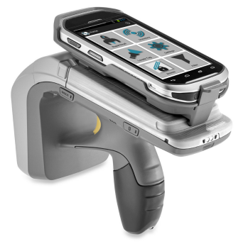
RFD 8500 RFID 1/2D Scanner

Equipment tags are made to withstand harsh environments and conditions.