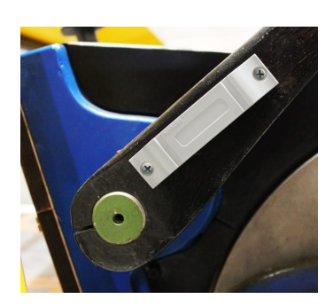
UHF RFID Hard Tag