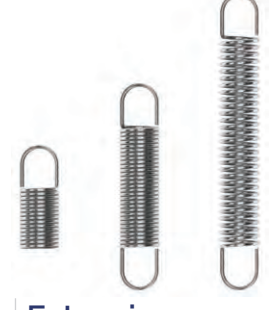
Extension Wire Springs