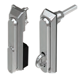
Swing Handle Locks

Available in stainless steel 304 and 316 with protection ranging from IP40 to IP69K. Most parts are manufactured with food grade grease, however where this is not the case, food grade grease can be requested to satisfy hygiene requirements.