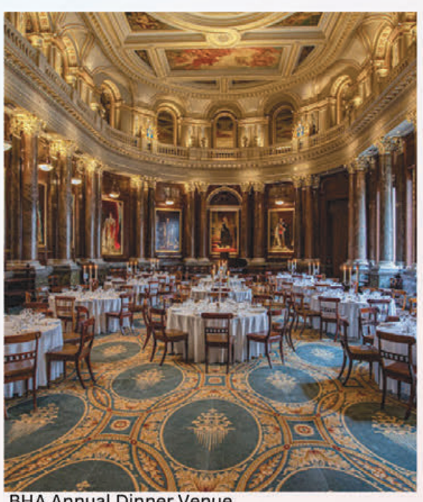
BHA Annual Dinner Venue