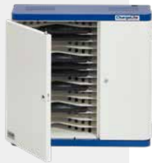
ChargeLite™ Wall 16 Devices