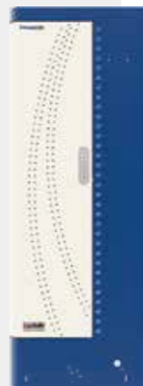
ChargeLite™ Locker 32 32 Devices