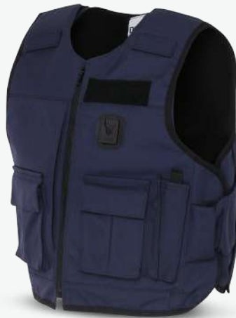
Hospital security with side entry and bespoke pipe pockets