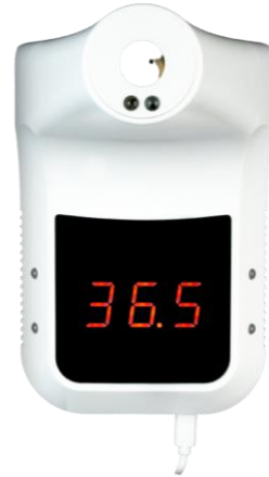
No Touch Infrared Fever Detection