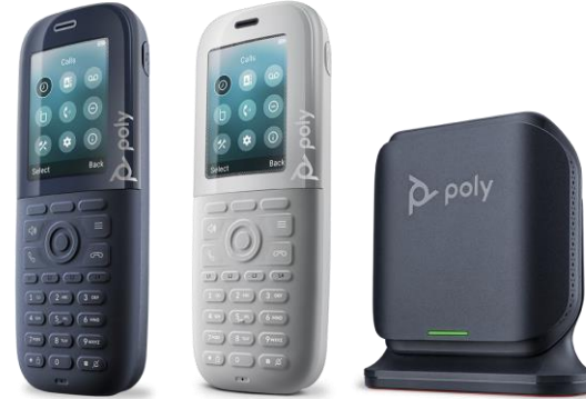
Microban Anti-Microbial IP DECT Cordless Phones