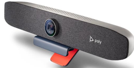
Video Conference Bars