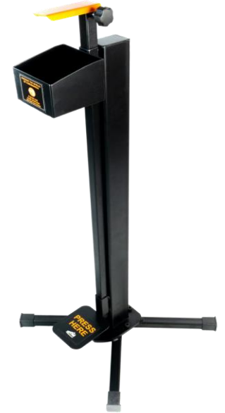
Contactless Sanitiser Dispensers