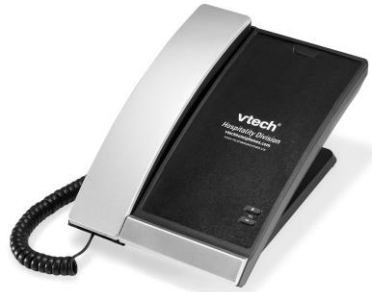
Coated Keyboards Anti-Bacterial Coated Phones