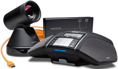
Video & Audio Solutions