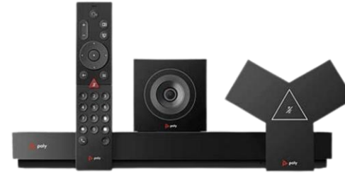
Teams & Zoom Rooms