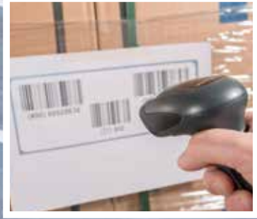
Electronic documentation Coordination with carrier and customer specific labelling