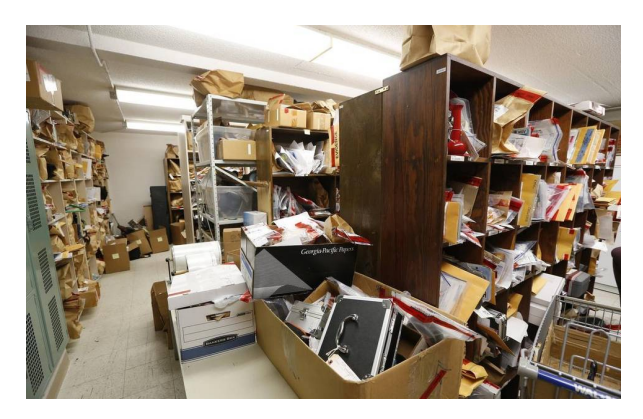
Before Hardcat Lebosi Enterprise: Search

Annual Cost $250,000 30 minutes per search 10,000 searches Hours per year = 5000 Cost per hour = $50