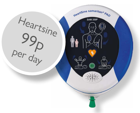
Examples of some of our deals

Fully covered for the whole term or your contract if used or out of date, replacement within 24 hours