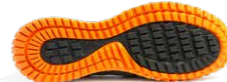
R4132 BB4500 Safety High Top