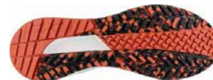
R3613 FE4 Adventure Safety