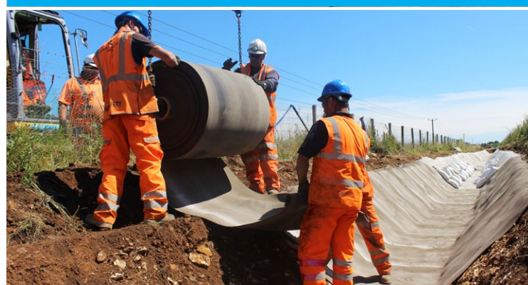
CC Bulk Roll