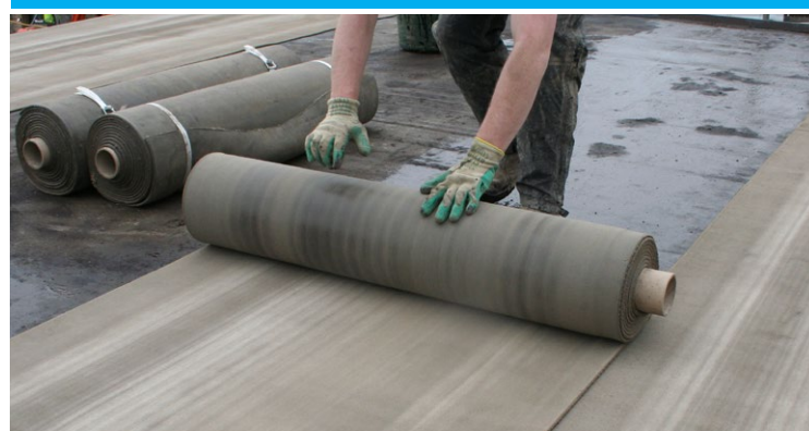
CC Batched Rolls