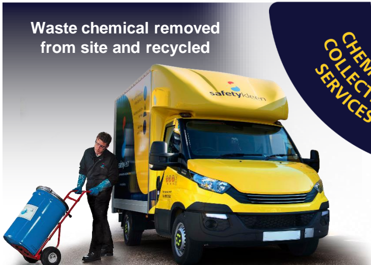
Waste chemical removed from site and recycled