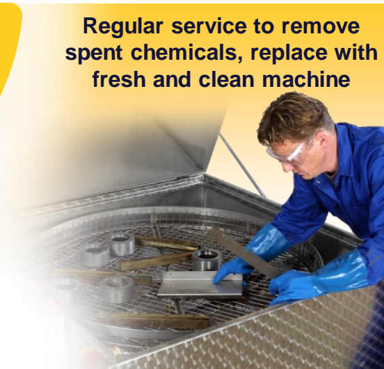
Regular service to remove spent chemicals, replace with fresh and clean machine