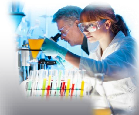
Tailored Aqueous & Solvent chemicals supplied for machine