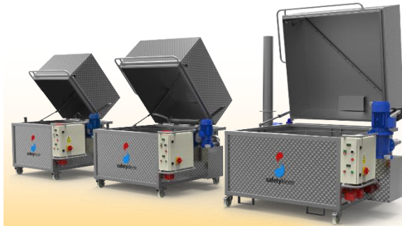
Parts Washer supplied and installed, with no customer capital outlay