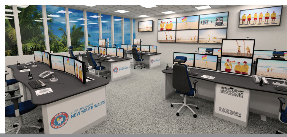
bove: 3D render proposal drawing provided as part of the free design service by Thinking Space

Thinking Space worked with the client to understand their requirements in terms of monitoring and analysing data. Key working practices carried out by the different operator roles were identified, and each console type was custom designed to meet the current operational requirements whilst also having the flexibility to be adapted seamlessly to meet any future requirements.