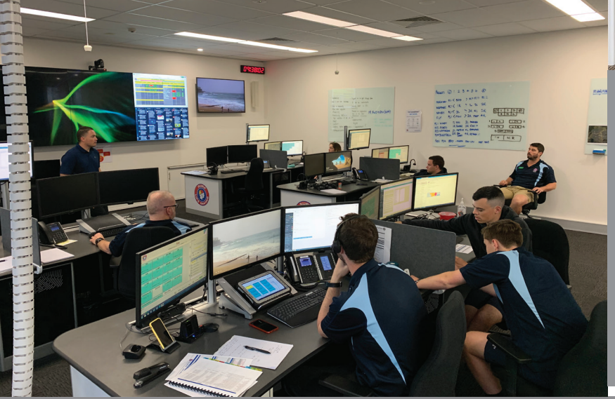
Thinking Space Systems Pty Ltd Unit 1, 55 Holbeche Road Arndell Park NSW 2148 Australia