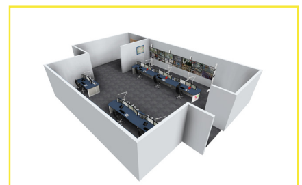
Rendered drawing to visualise the proposal