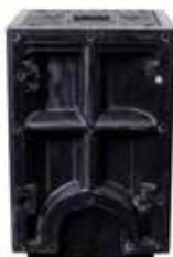
Small 300 x 300