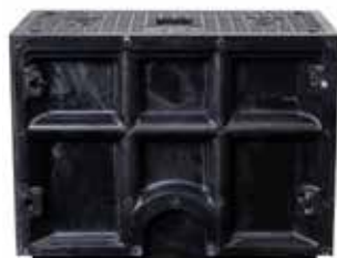
Medium 600 x 300