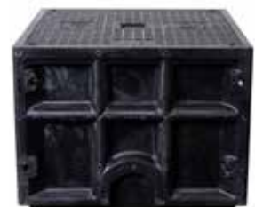
Large 600 x 600