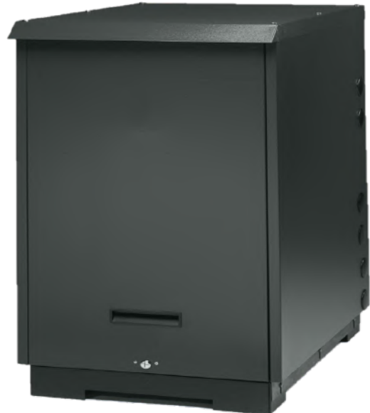
Sunamp External Casing with preplumbed option