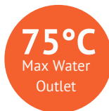
22kW model - single phase