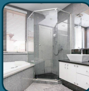
Cleaning is easier