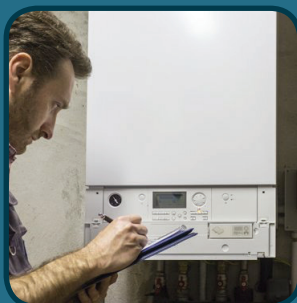
Protects boilers & equipment