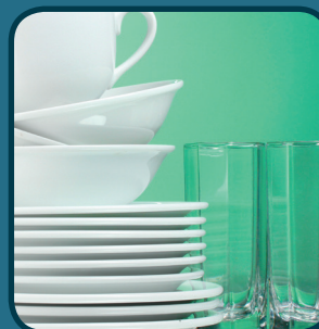
No residue or spotting