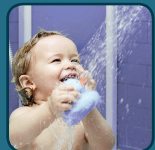
Kinder to sensitive skin

For more information, email info@halcyanwater.com