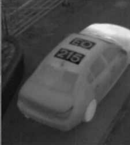
Mirage Thermal ID marking film