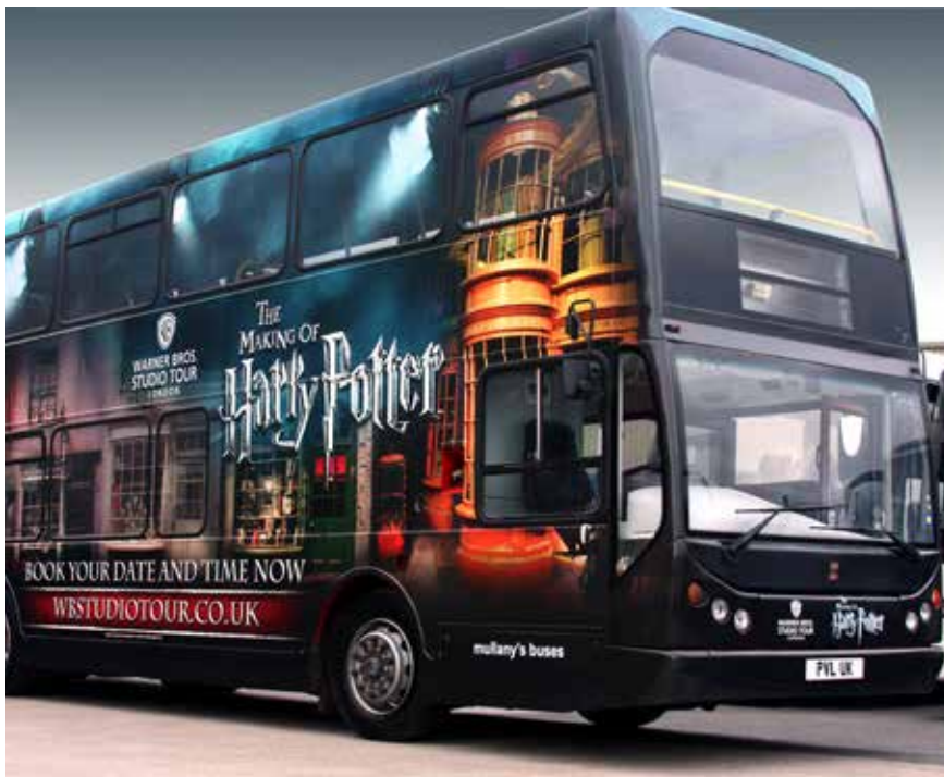
Full wrap with perforated window film