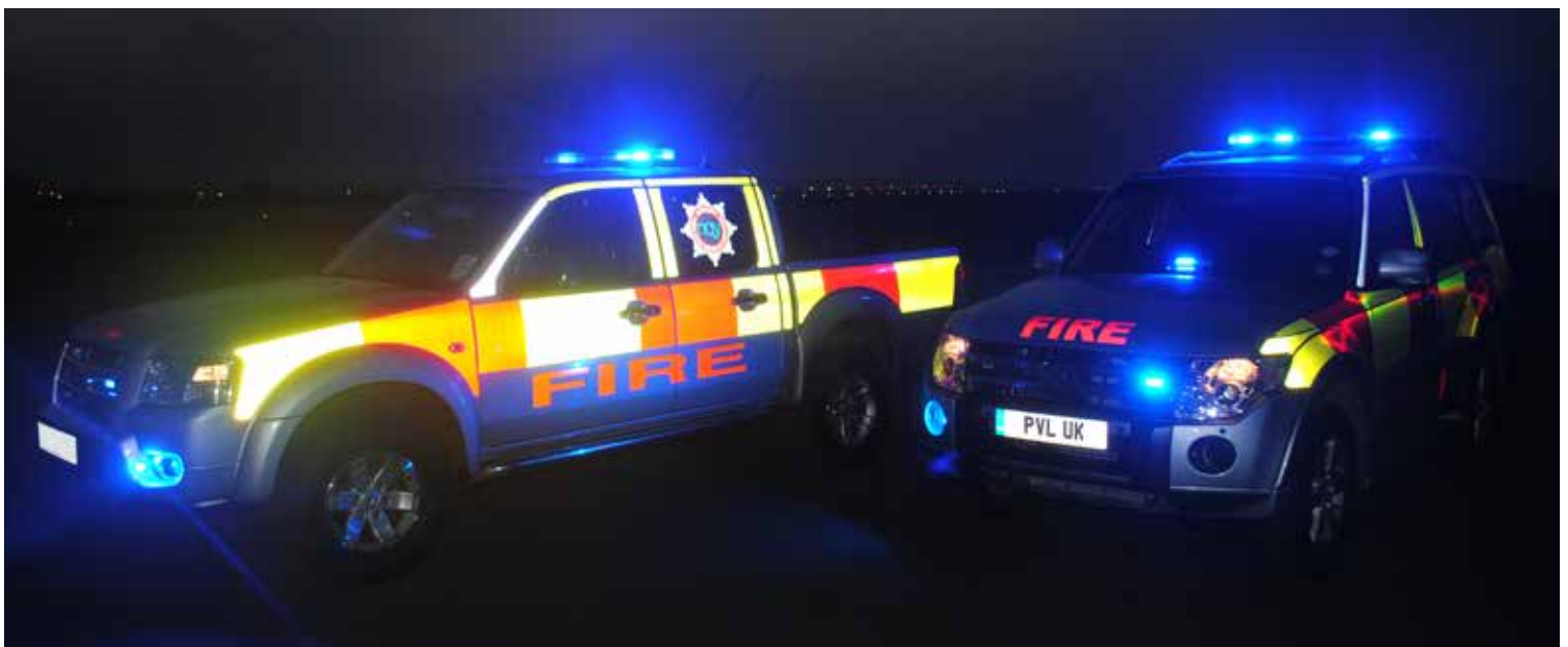
Accredited convertors for 3M DG3, Nikkalite, Avery and Orafol products

Comprehensive manufacturer backed warranty