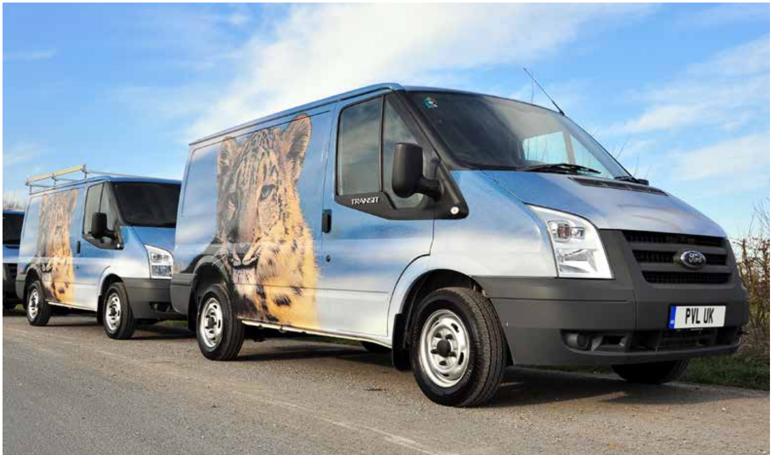
Snow Leopard vans shown are some of a 900+ fleet completed