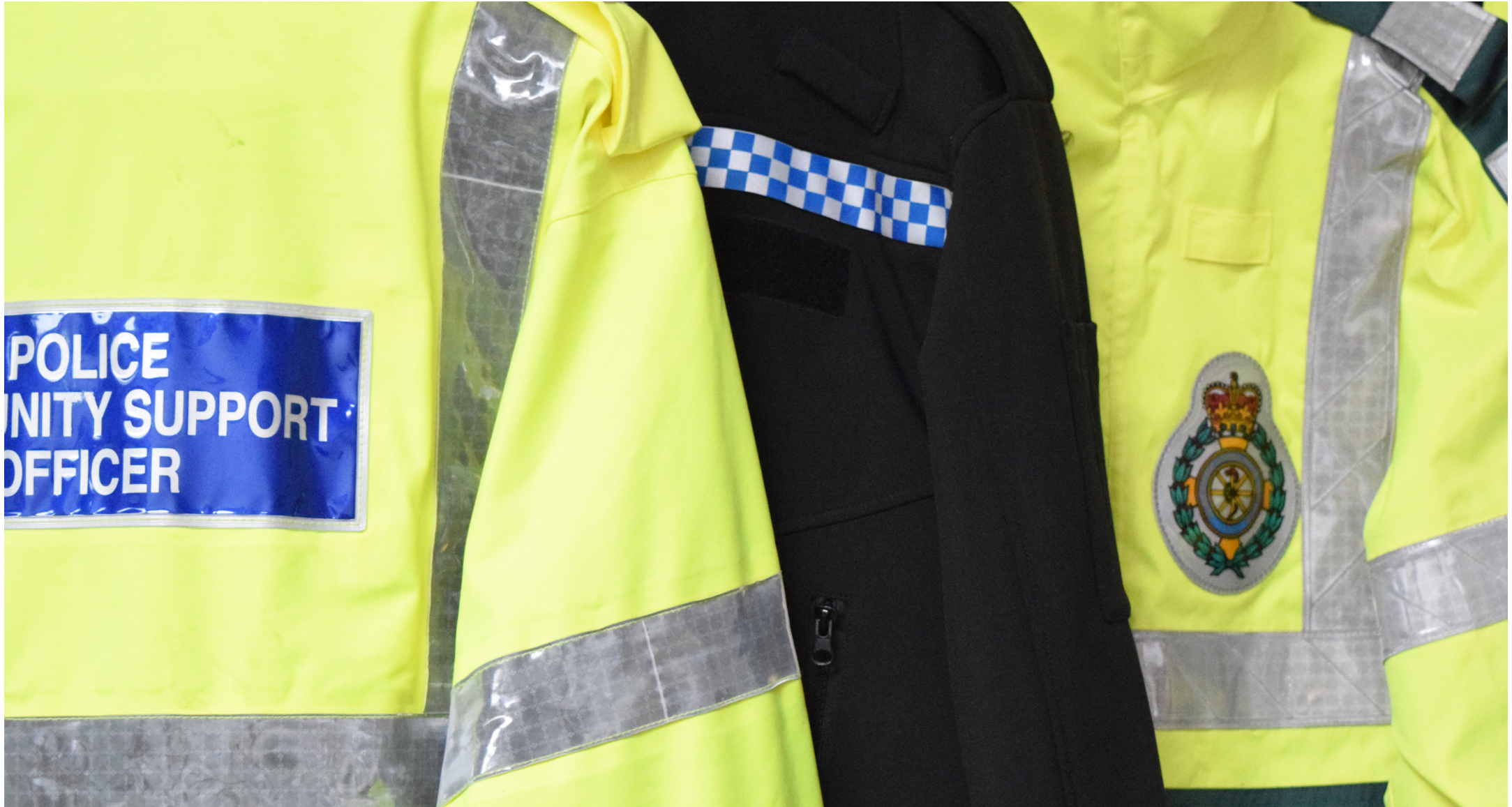
EQUIP - DEFEND - PROTECT