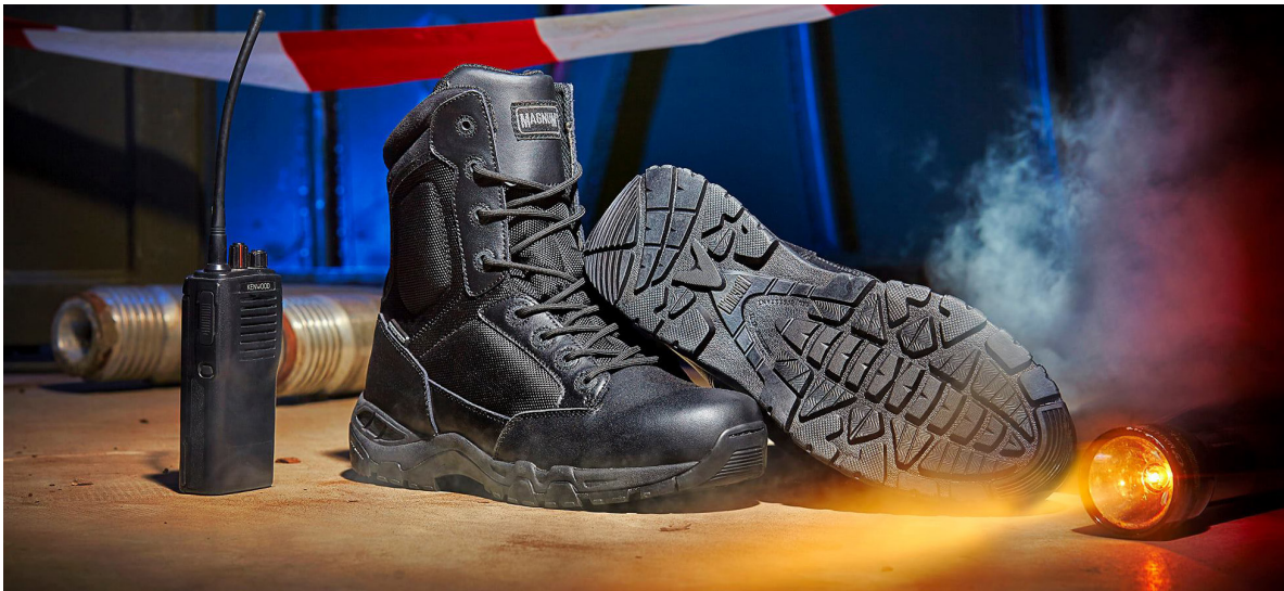
EQUIP - DEFEND - PROTECT

How much more could the emergency services achieve with better products?