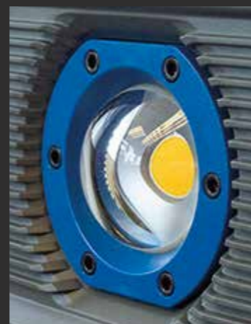
Convex Lens Improved light beam

COB LED brighter and higher quality beam of light