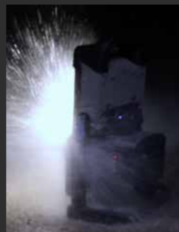
IP65 Rated Impact resistant aluminium housing