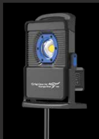
Tripod mountable (5 + 10K models)