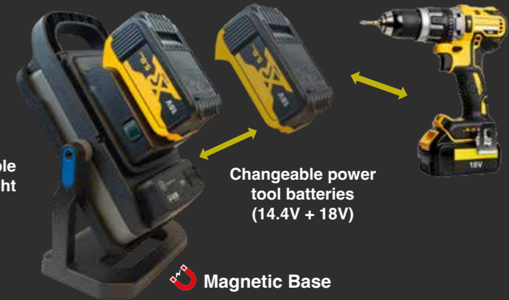
Changeable power tool batteries (14.4V + 18V)